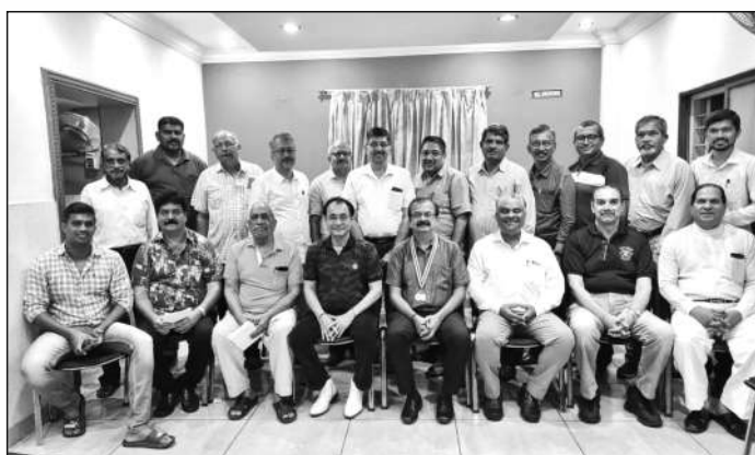
Board Meeting of the Club for July.